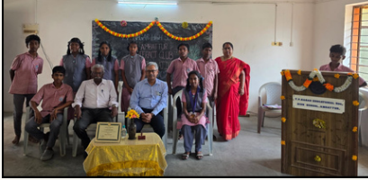
Interact Club of T.V Nagar School - Aug 7 th