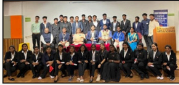
Rotaract Club of S.A College of Arts and Science - July 31 st