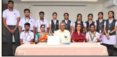
Interact Club of Bhaktavatsalam Vidyashram School - Aug 3 rd