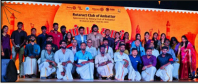
Rotaract Club of Ambattur July 6 th